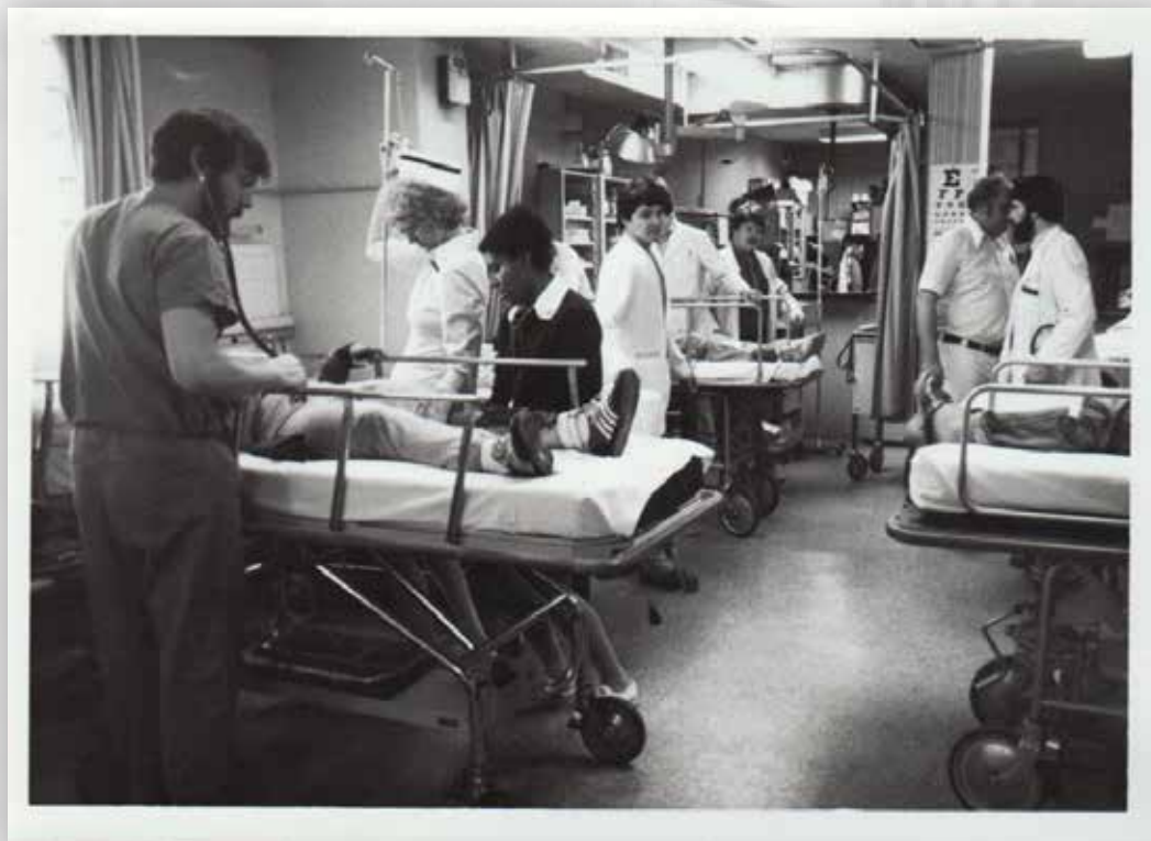
The Emergency Room at Cranston General Hospital (undated)

If anyone can identify any of the individuals in this photo, please contact RISOPS. Thank you!